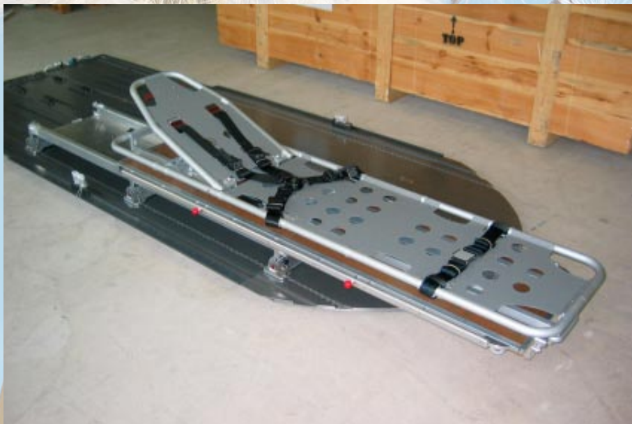
Cirrus for H145