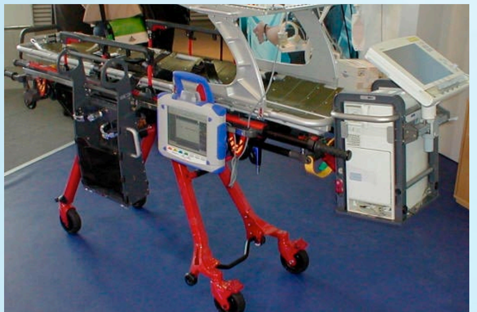
Dual Use Intensive Care