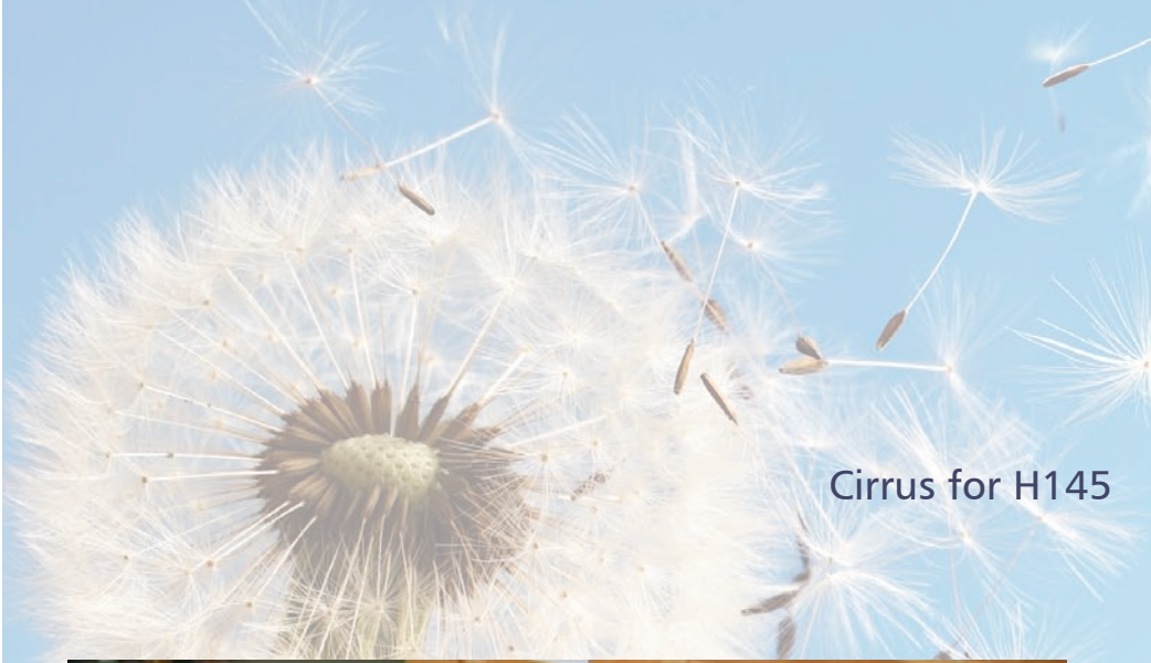
Cirrus for H145

AW109SP, AW139, AW169, H135, H145, Bell429